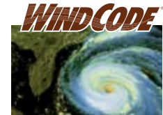
WIND CODE® reinforcement available up to W1 design pressure (DP) 14 PSF, depending on size. Doors tested 50% greater than DP.